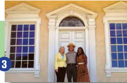
Historic Hampton, Baltimore County