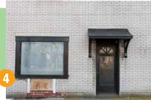
Potomac House, Washington County (2012)