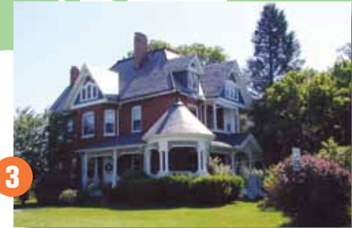
Main Street Middletown, Frederick County