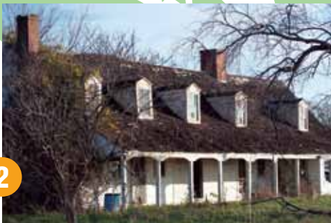
Covington Store, Kent County (2012)