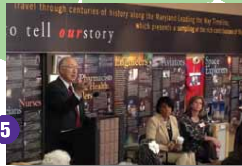
Women and the Making of U.S. History, Statewide