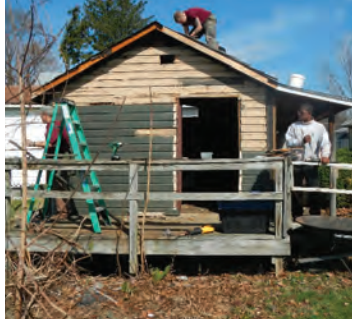
HISTORIC FINDS at the miner's cabin, pictured below, include the shirt at right. It was found stuffed into a cabin wall and likely served as makeshift insulation.

TO LEARN MORE about the project, visit catocctinfurnace.org .