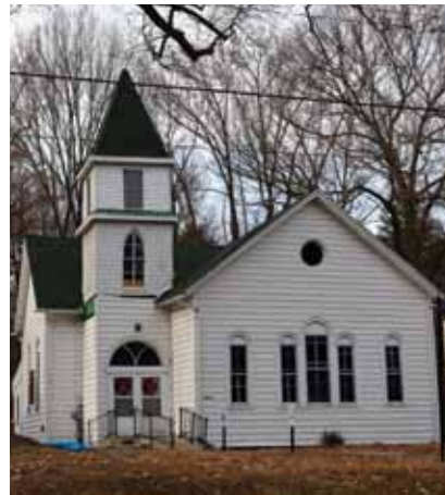
The church after stabilization

Naturally, finding the funds to save the church were part of the challenge. Beckley facilitated the church's designation as an historic site by the county's historic preservation commission, a first step in becoming eligible for several funding sources. As one of the oldest and largest buildings owned by the church's governing body, there was pressure to abandon Asbury and combine the congregation with another to save money.