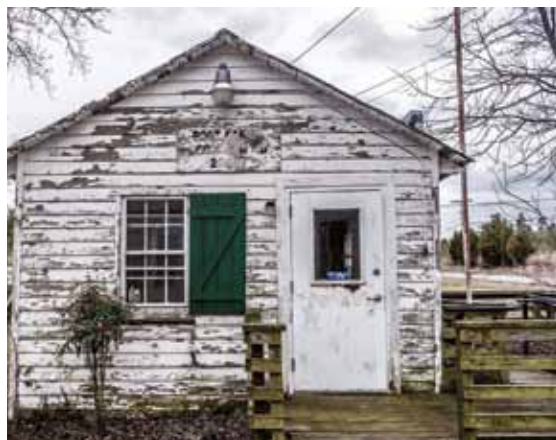
Scotland Post Office, St. Mary's County (above) Typical of rural mid-20th century post offices that served as community gathering spots, the building is available for moving if a new owner can be found.

THE ENDANGERED MARYLAND SITES chosen in 2013 join 64 others identified since 2007 as the state's most threatened historic resources. Selected through a public process, the sites are chosen where greater awareness of the threats to them may encourage a preservation solution. Of those designated Endangered Maryland, only two have been lost. Several have been saved or are the subject of encouraging developments which may lead to their preservation. For a complete listing of Endangered Maryland and the status of each site, visit, www.preservationmaryland.org . Margaret De Arcangelis, education and outreach director, directs the Endangered Maryland program.