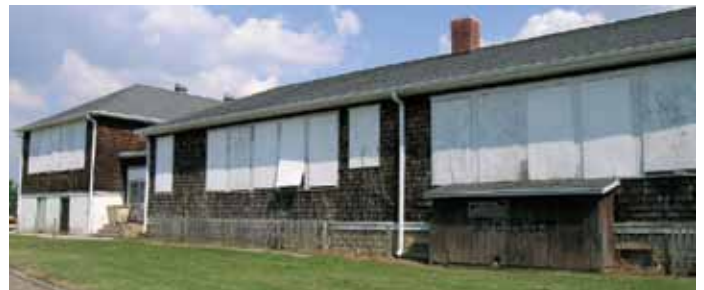
Kennard High School before renovation