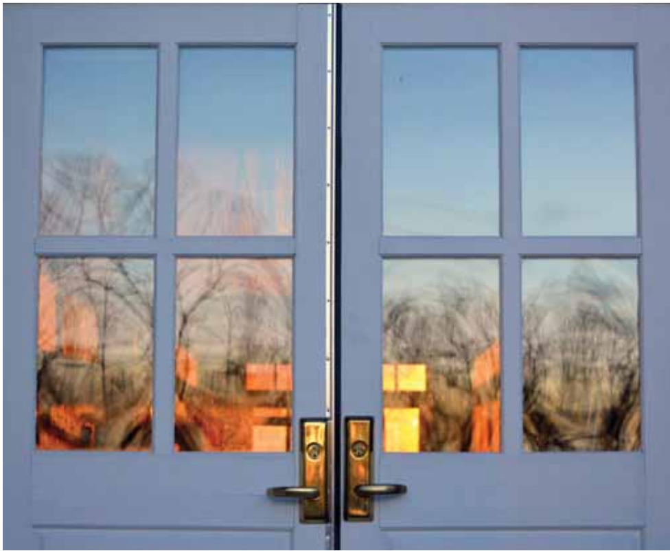
The entrance to the historic Kennard High School welcomes visitors to the facility.