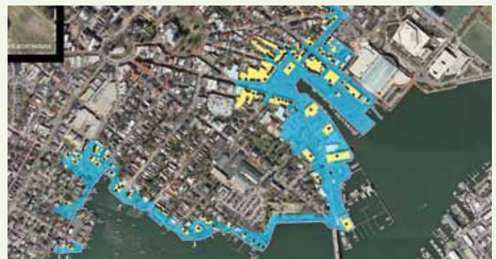
Properties shown here are within 10 feet of the elevation line. Annapolis's hazard mitigation plan will blunt the impact of future extreme weather events on this historic district.