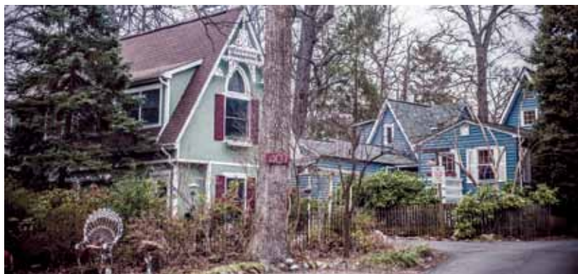
Washington Grove, Montgomery County (above) proposed zoning changes and nearby development encroach on the integrity of this 1873 Methodist camp meeting site, now home to year-round residents living in 220 houses.