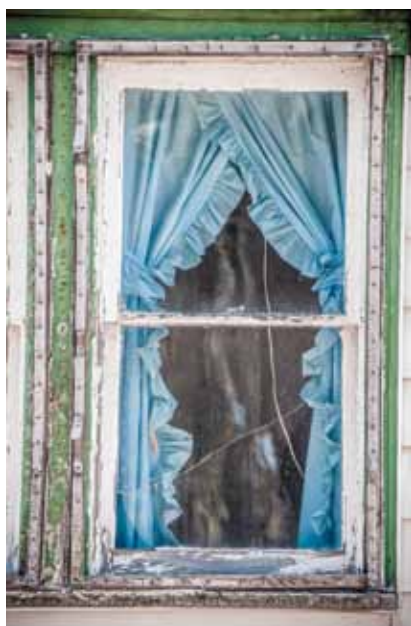
Locust Grove and Fort Frederick Schools, Washington County 19th century schools like these (left) may disappear if new uses and stewards cannot be found for them.