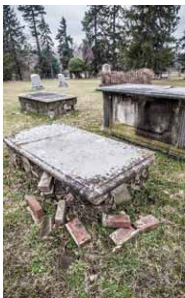
Rogers Buchanan Cemetery, Baltimore City Originally a family cemetery (right) , the property is now owned by the City of Baltimore which has failed to maintain or protect its monuments and landscape.