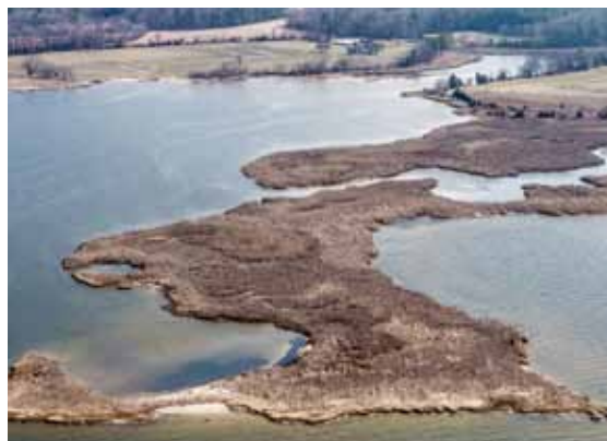
Indigenous Landscapes, Multiple Counties (above) Twelve sites in the Chesapeake region are associated with Native Americans but lack land management plans to protect their historical integrity.