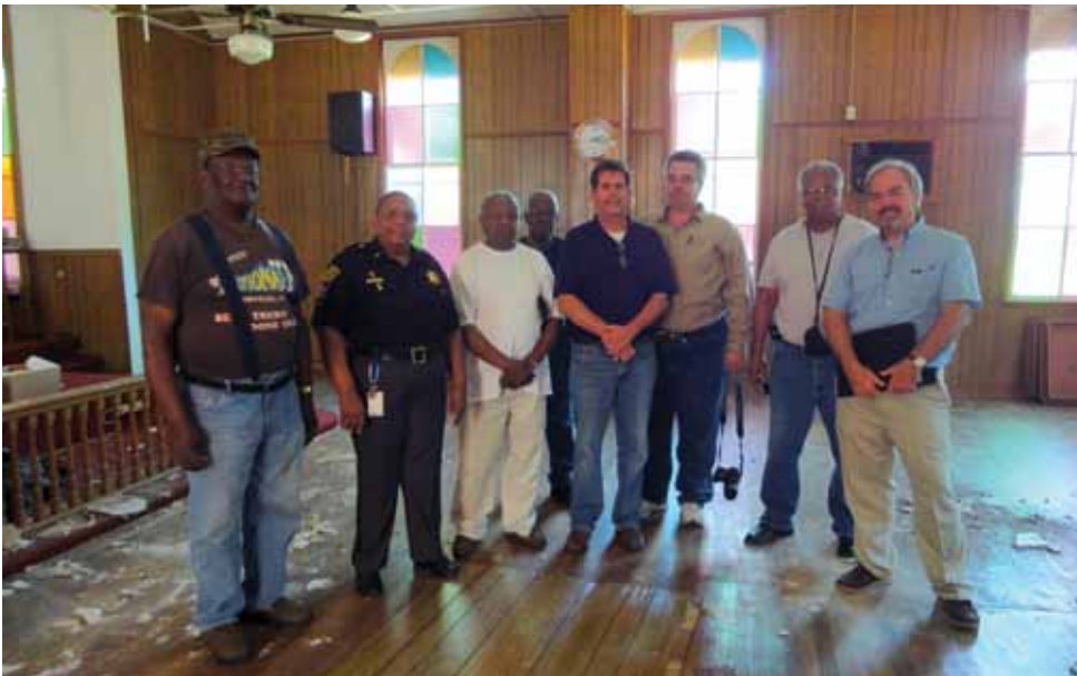
The Asbury Church (Kent County) restoration team included congregants and preservation professionals.