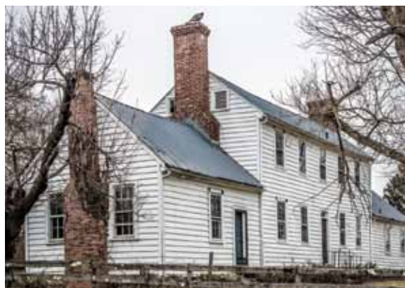
Montanverde, Montgomery County A preservation-minded owner is sought for this deteriorated early 19th century house (above) built by the last military officer to be commissioned by George Washington.