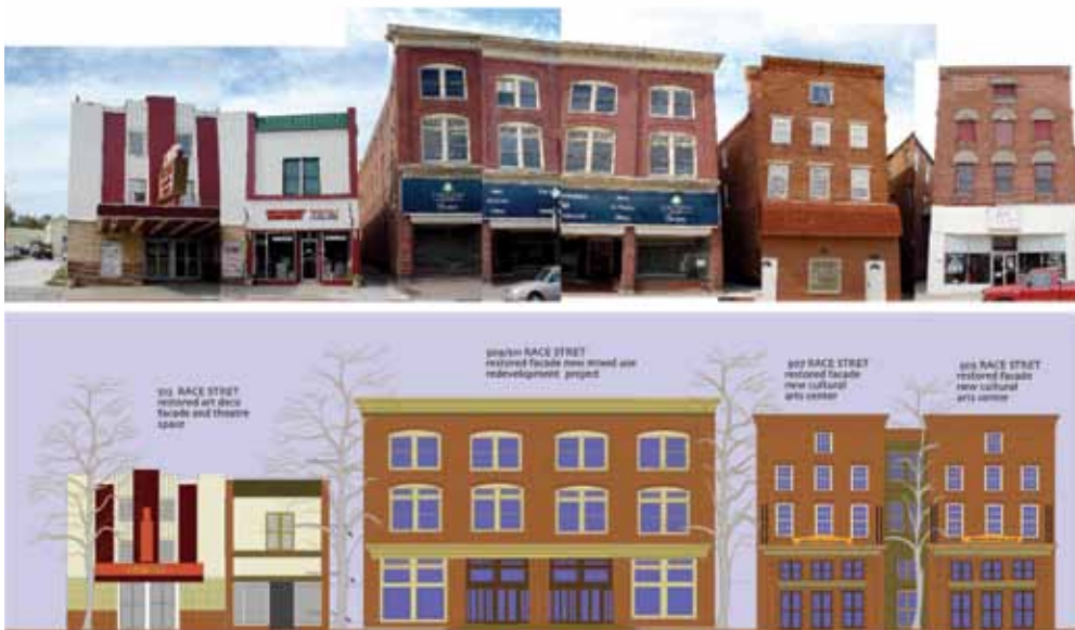
Existing (above) and proposed redevelopment of the 500 block of Race Street Courtesy Jay Corvan, AIA