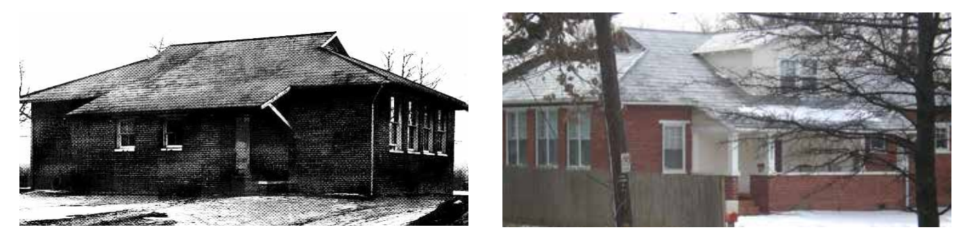
Wheaton was one of the first brick two-room schools (left, courtesy of Peerless Rockville); today it is a two-story residence (author photo)

Chevy Chase School, now an elegant home, has a fascinating history all its own. Built near the close of the 19th century, it was one of the first down-county schools. Until the early 1900s, students close to Washington, DC, often commuted to schools there. Chevy Chase, Maryland, was then being developed as an early suburb. The developers built the school—no doubt thinking it would attract home-buying families—and donated to the school district the land on which the school sat, but the County paid the construction costs of $2,200—significantly more than other schools. Still, many new residents chose to send their children to a highly regarded school just over the line in Chevy Chase, DC. As a result, under-enrollment of the Montgomery County Chevy Chase School forced its closing in just five years—and it was sold for a $500 loss. However, in 1911 Washington started charging Maryland residents to send their students there and a year later an act of Congress flatly prohibited Montgomery County students from attending DC schools, necessitating the County to build another school in Chevy Chase.<sup>36</sup>