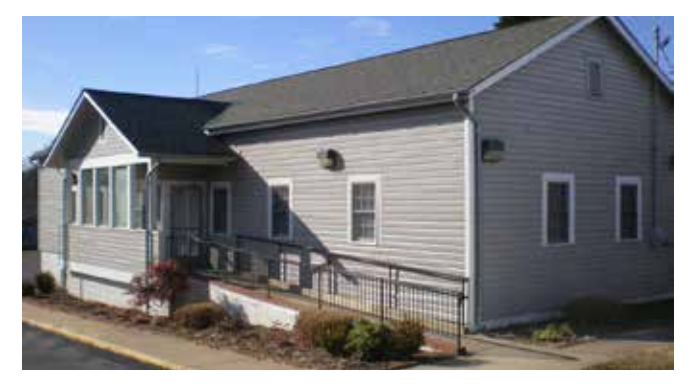
Smithville is the County's only Rosenwald school restored as a school museum (author photo, above; 1998 photo prior to restoration courtesy of MHT, top right; historical school photo courtesy of Alpha Phi Alpha Montgomery County chapter, bottom)