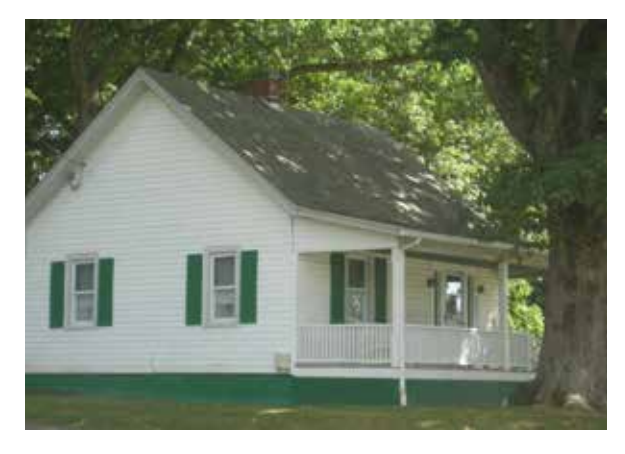
Dating to the 1860s, this home was once Light Hill School

Seven historic one-room schools exist today with relatively few modifications; despite being converted to homes, they all pretty much retain their original shape and appearance: Mt. Lebanon, Light Hill, Cedar Heights, Grifton (all in the County's northeastern portion), Dawsonville (in western Montgomery County), Sandy Spring, and St. John's Academy. Light Hill is the oldest of this group of survivors; it was one of the first built by the nascent County school district in the 1860s (like Brookeville's one-room schoolhouse).<sup>29</sup> Sandy Spring sits next to the venerable Friends Meetinghouse and initially housed grades 1-3 for the private Sherwood Academy (run by Quakers), which joined the public school district in 1906; its heritage is thus both public and private like Seneca and some of the early black schools.<sup>30</sup>