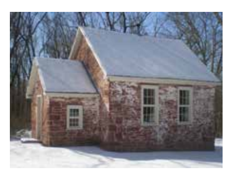
Brookeville (top) and Seneca are two of the earliest—and smallest—public schools surviving today

A short distance away also in Brookeville is a circa-1865 wooden one-room schoolhouse that is one of the first built by the nascent Montgomery County public school system. Despite some earlier attempts,<sup>5</sup> public education did not become firmly established here until 1864 when a new Maryland constitution provided for statewide free public education administered county by county,<sup>6</sup> the system existing today. A quintessential one-room wooden school, Brookeville remained in use until the early 1920s, a lengthy lifespan not unusual for these humble buildings. After years in private hands and often vacant, it was restored in the early 2000s as a school museum thanks to a joint Town and volunteer undertaking.<sup>7</sup> It is appropriately painted white—few early schools were actually red.