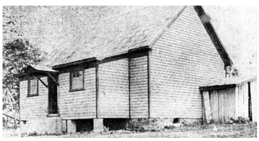
The Seneca Mills one-room schoolhouse still stands as the left-most portion of a residence that nearly dwarfs it