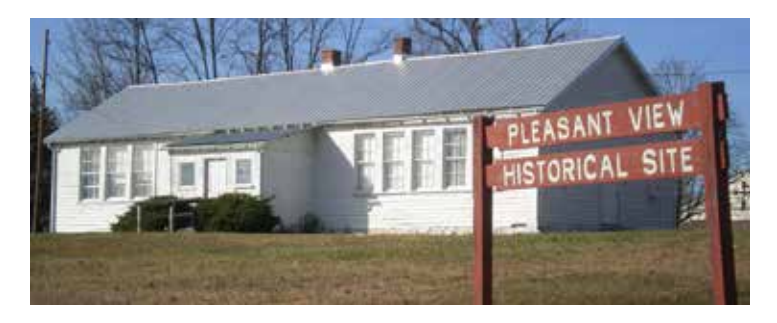
Quince Orchard School is part of the present-day Pleasant View Historical Site

The remaining two black schools still standing, Quince Orchard and Martinsburg, followed a similar historical pattern to Mt. Zion. Quince Orchard, south of Kentlands, dates to 1874—just two years after black public education was instituted—although black residents opened a school there earlier, and then established a church—a reversal of the usual pattern.<sup>23</sup> When the school burned in the early 1900s it was replaced by one nearby that had been for white students.<sup>24</sup> So in addition to receiving used books, black schools themselves were sometimes hand-