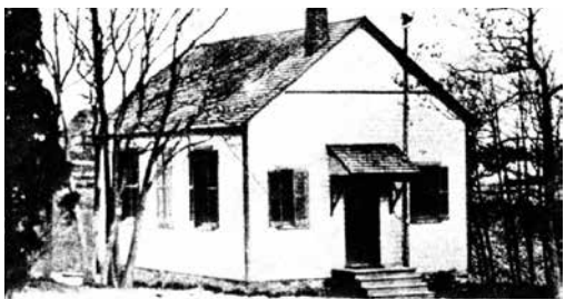
The Garrett Park one-room schoolhouse (above,) today sits behind a screen porch and exists as part of a larger dwelling (, left)