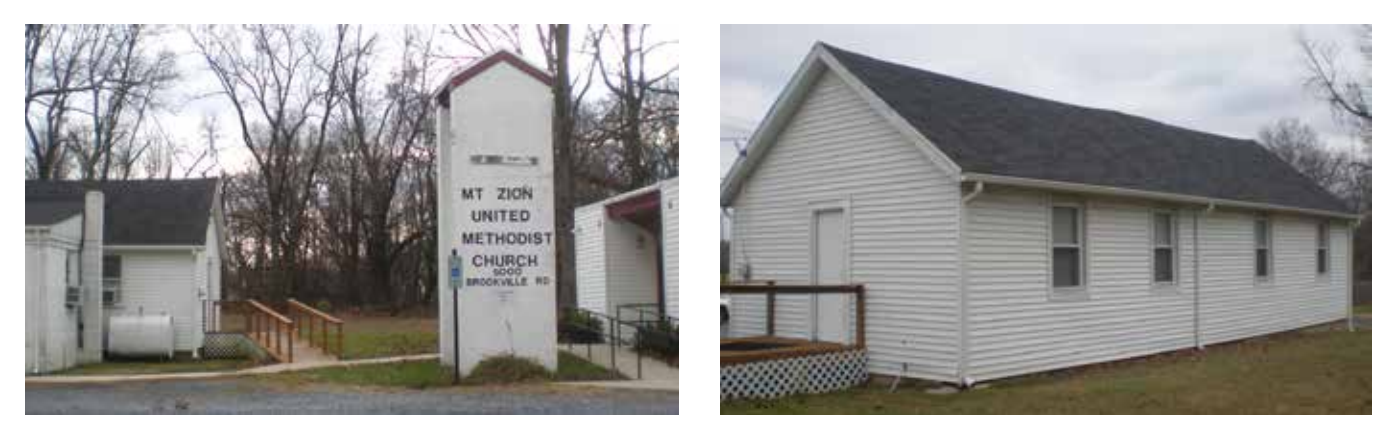
Mt. Zion School (at left above and from its other side to show a later addition) was one of the earliest public schools for African-American children

This was the case in Mt. Zion. Tellingly, the school sits on the same plot of land as Mt. Zion United Methodist Church. The present-day church replaced one established by newly-emancipated slaves in the mid-1860s. The original also served as a school even before public education for African-Americans was mandated in Maryland.<sup>10</sup> This did not come about until 1872, eight years after the new state constitution which had instituted public education (for white children, though not explicitly). The constitution also abolished slavery but made no provision for education of the children of emancipated slaves. Despite adoption of the 14th Amendment to the U.S. Constitution and its guarantee of equality in 1868, there was little likelihood that black students would be joining their white counterparts in the existing public schools. After all, Maryland had rejected the proposed federal constitutional change in 1867 (and did not formally approve it until 1959). And so arose segregated schools.<sup>11</sup>