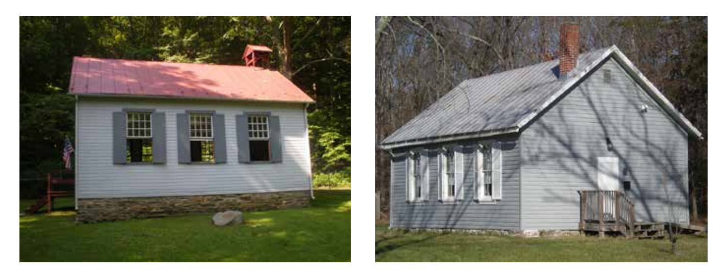
Though similar in appearance, Kingsley (left) was for white students and Boyds housed African-American students

The other two school museums—Boyds and Smithville—were, like Mt. Zion, originally schools for African-Americans. Each adds significantly to the story of school segregation, but turns this unfortunate history into a positive learning experience today; as a roadside sign in front of one of them aptly puts it: "That which was designed to separate us will unite us."