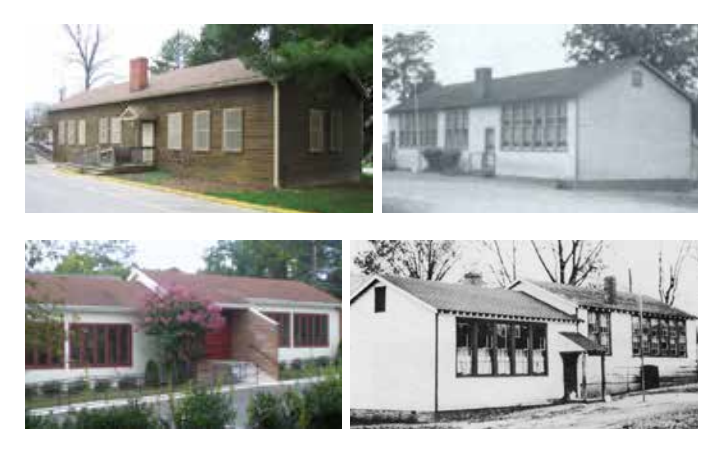
Norbeck and Ken-Gar Rosenwald Schools retain their basic shape despite renovation (author photos, left; top right photo courtesy of M-NCPPC , bottom right photo from the book From One Room to Open Space)

Three other Rosenwald schools-nearly identical to Smithville when built-are still standing in Montgomery County but less recognizable as schools today: Norbeck, Ken-Gar, and Poolesville. Norbeck (between Rockville and Olney) and Ken-Gar (on the boundary of Kensington and Garrett Park) are now County-owned recreation centers. Despite significant renovations, each is the same basic structure as when it was a school. Poolesville (about a mile north of its namesake town) is a fueling station for the County Department of Transportation-a fate similar to Smithville's use as a bus depot-but it is the only Rosenwald survivor to retain its characteristic large windows.<sup>18</sup> Norbeck, Ken-Gar, and Poolesville each stand near a historically blackchurch that figured in the development of predecessor schools, underscoring the role of churches in early education for African-Americans.