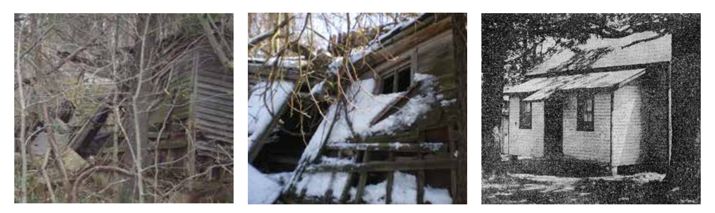
Elmer School is in barely visible amid underbrush and trees (left, author photo); a light snowfall reveals the doorway and a window (center, author photo) evident in a 1929 Maryland News photo (right)

Browningsville, though severely dilapidated, still shows what an eye-catching, imposing structure it was—one of the most visually interesting early schoolhouses in the County. Initially a typical one-room building, a second room was added along with a bell tower that created a formal entrance. A few years ago, the roof on the original one-room portion caved in under the weight of a heavy snowfall. The building's owners appreciate its significance but so far have been unable to restore it.