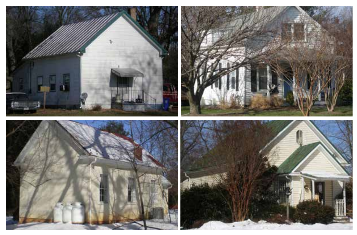
Dawsonville, Cedar Heights, Grifton, and Sandy Spring schools (clockwise from top left) as they look today