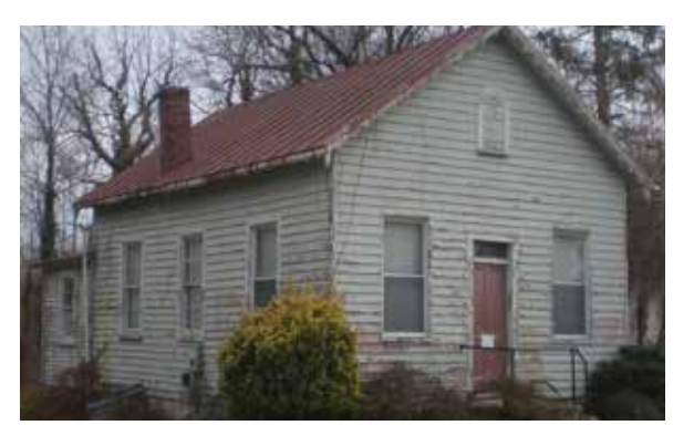
The only parochial school still standing is St. John's Academy for girls

St. John's Academy is the only parochial school among the early schools still standing. Located near the original St. John the Evangelist Catholic Church in Forest Glen, it was constructed by the parish in 1874 as a school for girls but just nine years later was converted into a rectory; it has been a private home since 1944 and today is in some disrepair.<sup>31</sup> Regarding education for girls in the days of these schoolhouses it is worth noting that both genders were generally afforded the same educational opportunities (and most photos show roughly equal numbers of girls and boys), though they sometimes sat on separate sides of the room.