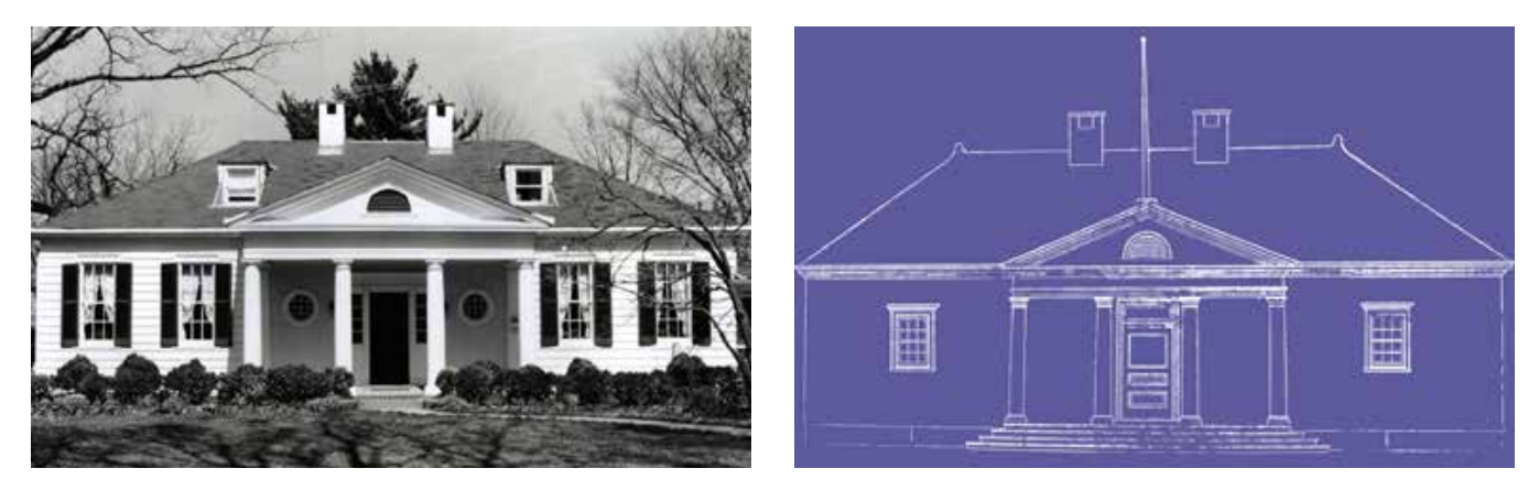
The two-room Chevy Chase School as it looks today (left) and in a blueprint drawing of the original school