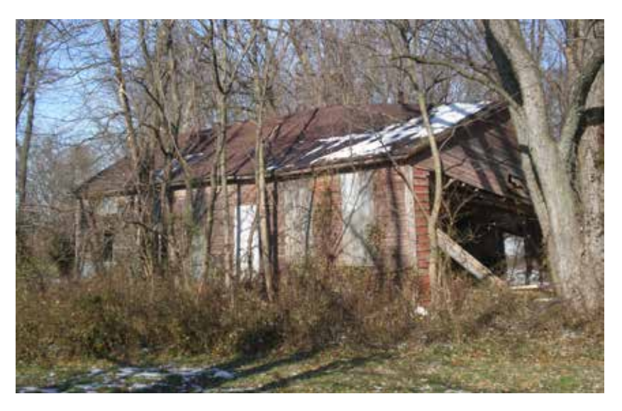
Poole's Tract School has deteriorated greatly over the years

All are on the western edge of the County in still rural settings today: Poole's Tract, Elmer, and Browningsville. Originally a one-room school, Poole's Tract gained a second room at some point but remained a simple, relatively small school; when it closed a neighboring farmer bought it and used it for storage. It is mostly intact, but the years of neglect are evident. Elmer has nearly collapsed and is almost overgrown by trees and underbrush. However, its window frames and distinctive interior metal wainscoting are still evident.