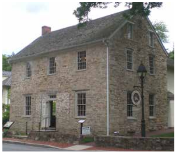
Brookeville Academy (c.1815) is the earliest schoolhouse still standing in Montgomery County

As a tuition-charging private school, Brookeville Academy predates public education. Incorporated by the Maryland General Assembly in 1815, it was one of the County's earliest private academies, at least six of which existed in the first half of the 19th century as the only option for formal education prior to the institution of public education midcentury. (Predating Brookeville was Rockville Academy, whose building—a replacement of the original structure—also still stands but is not included in this listing because it is a larger, multi-room structure.<sup>4</sup>) Brookeville Academy's trustees sold the stone building in the late 1860s and it deteriorated over the years. The Town of Brookeville bought it in 1989 and restored it as an attractive meeting space for community events and private rental functions.