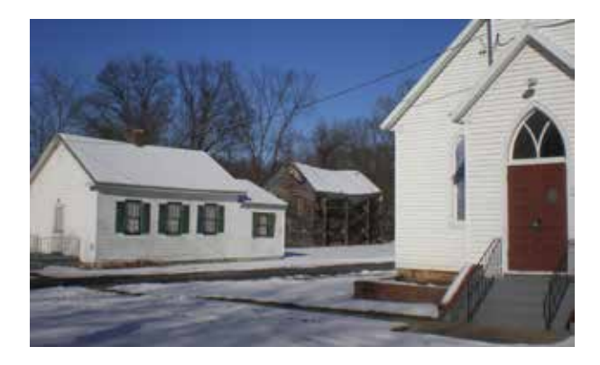
Martinsburg (left) School sits next to the historically black church that initially housed the public school and in front of a dilapidated benevolent society building

The one-room Martinsburg school that still stands near the far western edge of the County also sits alongside the church which figured in its establishment; in fact, the church itself served as a school beginning in 1880—a prime example of a frequent pattern. The school district finally paid for a school building to be erected in 1886. Behind this school is another noteworthy structure that stands today—the Loving Charity Hall, a benevolent society building. Such societies provided services like insurance that were otherwise unavailable to African-Americans. The Martinsburg site may be the last in Maryland to have three institutions standing that once formed the nucleus of many black communities.<sup>27</sup>