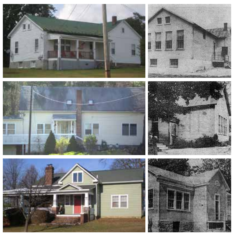
Lewisdale, Hyattstown, and Barnesville as homes today (left, top to bottom) and corresponding photos from the Maryland News, 1929. All have retained their basic shape; Lewisdale even has its original attic and basement windows on one gable end; Hyattstown's entryway appears gone, however.

Five other schools-now-homes were two-room buildings: Lewisdale, Hyattstown, Barnesville, Wheaton, and Chevy Chase. Lewisdale (midway between Hyattstown and Damascus) was the only one of these to start as a one-room school, in 1900; a second room was added in 1913,<sup>34</sup> giving the school an unusual T-shape-still its basic form as a residence today. This school replaced nearby Light Hill when the latter closed. Hyattstown and Barnesville were early two-room structures built of wood that looked similar to the numerous one-room schools onto which a second room was later added (that is, end-toend), but they included a center entrance between the two rooms-a feature that would become fairly standard. Wheaton, built in 1903 to replace a school that burned, was one of the first brick school buildings in the County. Unusual also was that Wheaton Colored School (long gone) stood adjacent; rarely were the separate schools for white and black students so close to each other.35