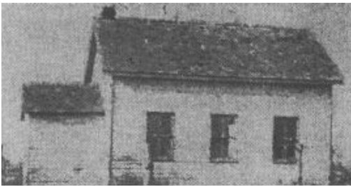
A one-room school (as shown in a Burtonsville Free Press photo, c. 1900, above), Fairland was expanded to become a home; the original portion is that with shutters on its windows today (author photo, left)