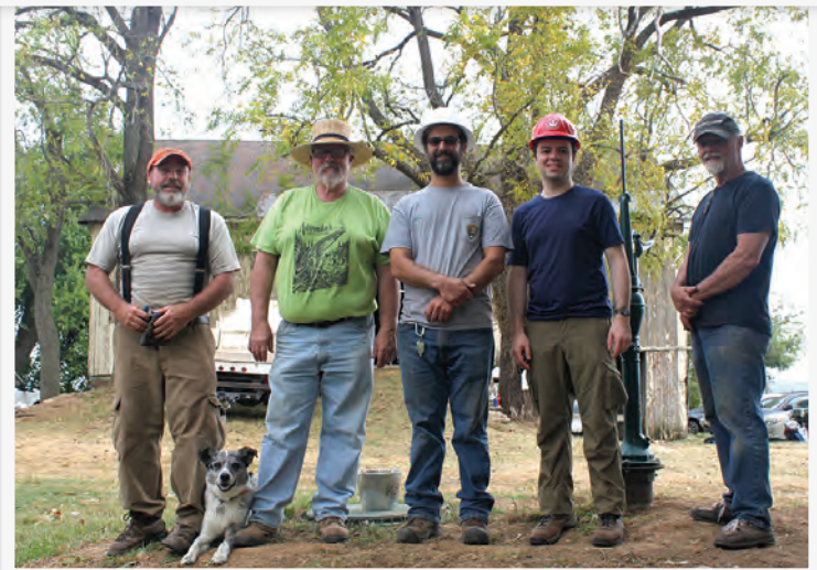
Workers from the National Park Service, National Historic Preservation Training Center, Burkittsville Preservation Association, and Preservation Maryland at the Shafer Farm near South Mountain Battlefield in Washington County, Maryland.