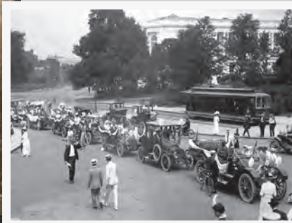
This triptych of historic images from the Library of Congress show the Couriers to Congress gathering in Hyattsville, Maryland before caravanning to Washington, DC, 1913.