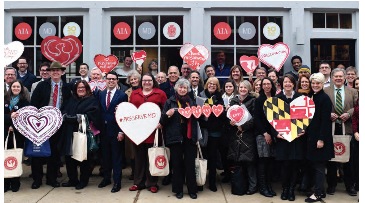
Lovers of Maryland history at Maryland History Advocacy Day, 2018.