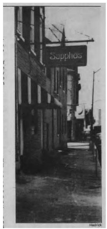
Sappho's Bar, pictured in UMBC Retriever, April 18, 1977, p 6