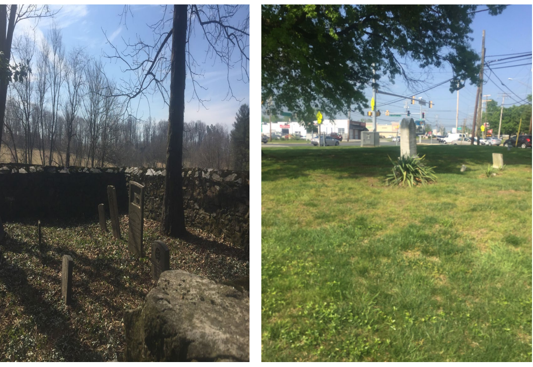
Hammond Family Cemetery, New Market, Frederick County. March 2019.

Merson Family Cemetery, Burtonsville, Montgomery County. May 2019.