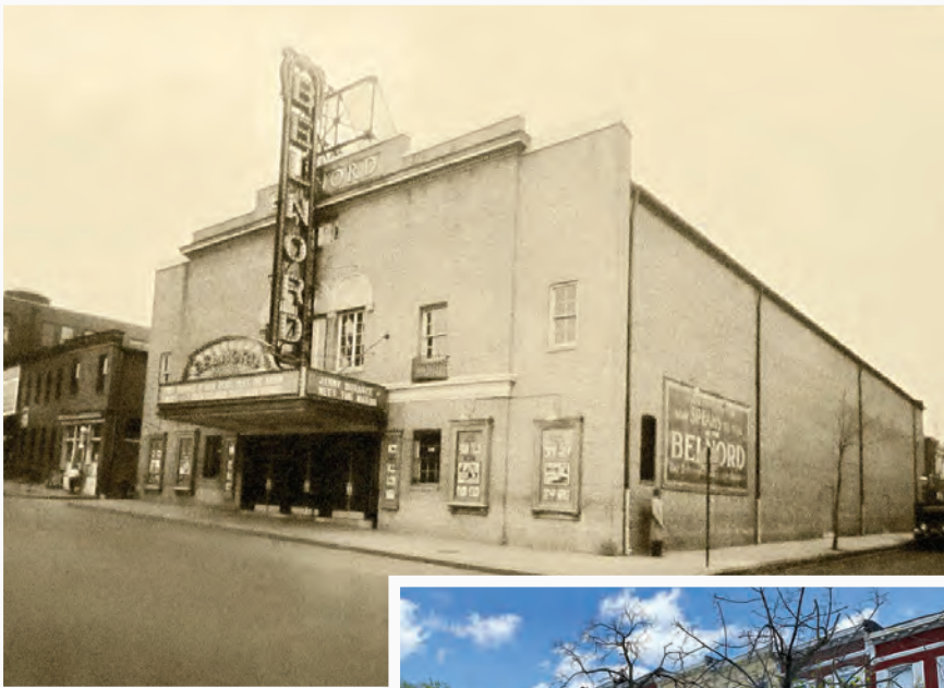
Historic image of the Belnord Theatre; streetscape of East Baltimore’s Midway neighborhood; the Sellers Mansion in West Baltimore; The Peale Center in downtown Baltimore.

The Peale Center for Baltimore History and Architecture will utilize a $7,000 grant in support of restoration work of the main open space and new gallery space of the circa 1814 building.